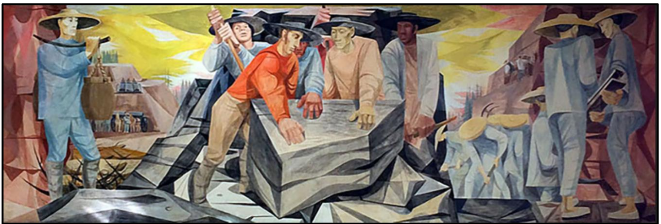
Panel from mural depicting Chinese workers constructing the transcontinental railroad, Anton Refregier, 1941. Located at: Rincon Annex Post Office in San Francisco (now Rincon Center). One of 27 panels of the mural "The History of San Francisco," the largest and last mural done for the WPA.

According to Mexican muralist David Siqueiros (1896-1974), "art should be visible in the most strategic places, visible to the working man, in public places, in sports arenas." (1)