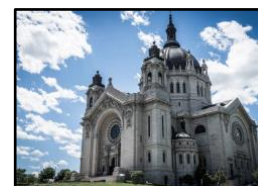
St. Paul Cathedral

The complete summer schedule is on the NorthStar website under Group Paint Events.