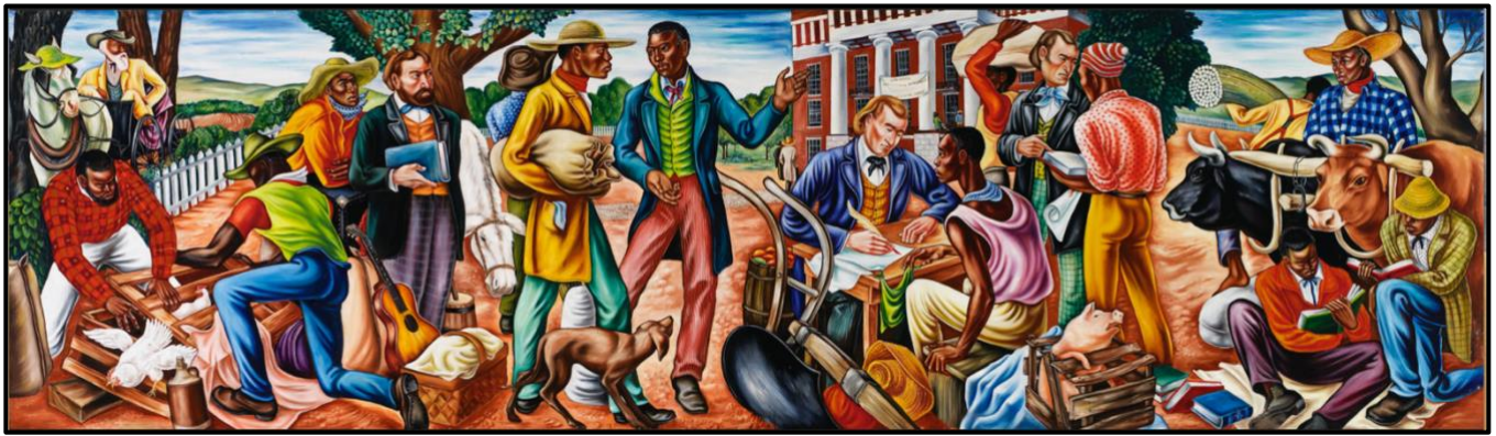
"Trial of the Amistad Captives", Hale Woodruff, 1939. Located at: Savery Library, Talladega College, Alabama.