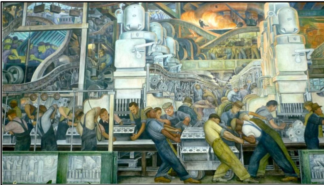
Detail from "The Detroit Industry Mural", Diego Rivera, 1932-33. Located at: Ford Motor Company, River Rouge Plant. One of 27 fresco panels. Detroit was the city hardest hit by the Depression.

Shown below are murals by Mexican artist Diego Rivera (1886-1957), African American WPA artist Hale Woodruff (1900-1980), and Russian-born WPA artist Anton Refregier (1905-1979). It's interesting to note the three approaches to the social realism style as well as socio-political themes. Hale Woodruff studied mural painting with Rivera in Mexico and featured scenes from the African American journey from slavery to freedom in his work. Anton Refregier's murals express his desire to tell what he saw as the true history of the American worker's struggle for rights and autonomy.