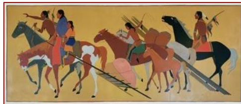
Mural – Kiowas Moving Camp, 1937 Stephen Mopope (1898-1974)