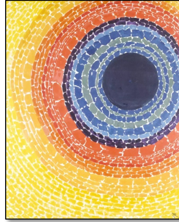
The Eclipse, Alma Thomas (1970).

As a student of art, an artist myself, a woman artist “of a certain age” with a love for abstraction -- I’m flabbergasted that only recently did I become aware of Alma Thomas. When images of her joyful watercolors and acrylics began popping up regularly in my InstaGram feed this spring and summer, I fell in love with her work -- especially the paintings she called “Alma’s Stripes.” They surprise me and make me think, inspire me and make me smile. I’ve even made a few little “stripe” paintings of my own. If you try some, too, let me know!