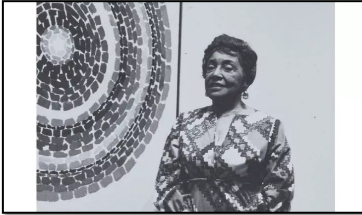
Alma Thomas at her 1972 Whitney Retrospective.