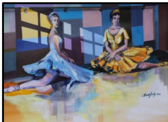
Ballet Series IV: Posed in the Studio