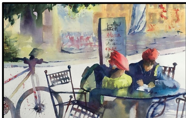
Before the Race