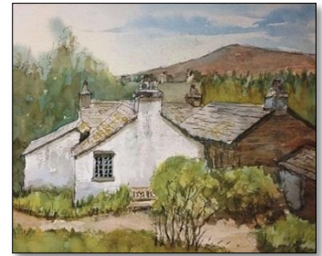
Dove Cottage, Grasmere UK

You can visit Bobbie’s blog at: https://aloftwithinspiration.com/ .